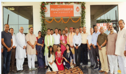
PU Skill Development Building Inauguration