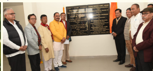
PU Hostel Building Inauguration