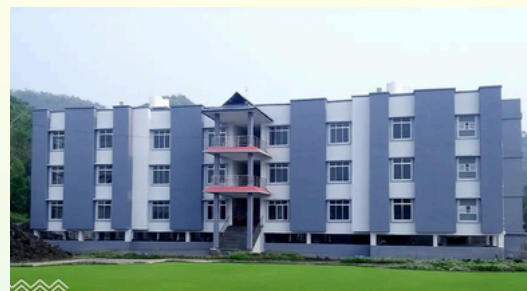
PU Hostel Building