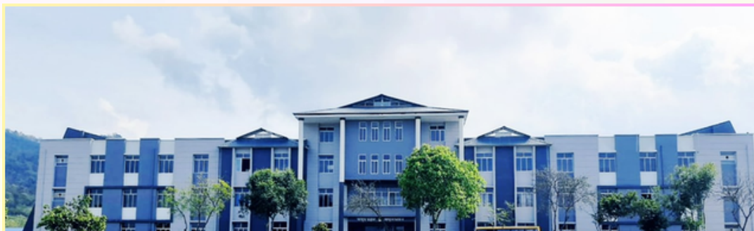
Pragjyotishpur University Campus

Shankardev Education and Research Foundation, Guwahati (SERF), is a proactive voluntary organization dedicated to advancing education, particularly through the implementation of crucial structural reforms within India's higher education sector. Established in Guwahati, SERF was officially registered on September 7, 2021.