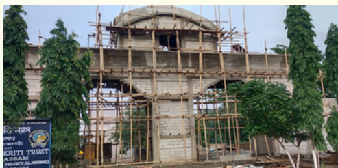
PU Entrance Gate